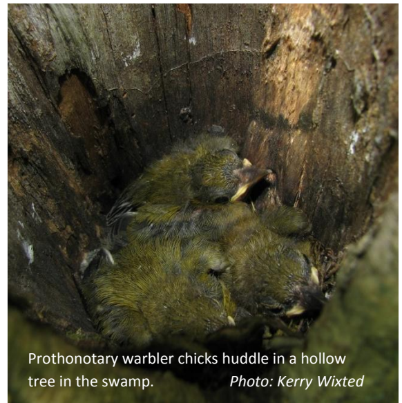
Prothonotary warbler chicks huddle in a hollow tree in the swamp.

Mature ash trees make up a significant portion of the IBA. With the scourge of the emerald ash borer, many of those trees will likely be lost. In the short term, this will create some new snags for nesting but in the long term it could open the canopy for invasive species.